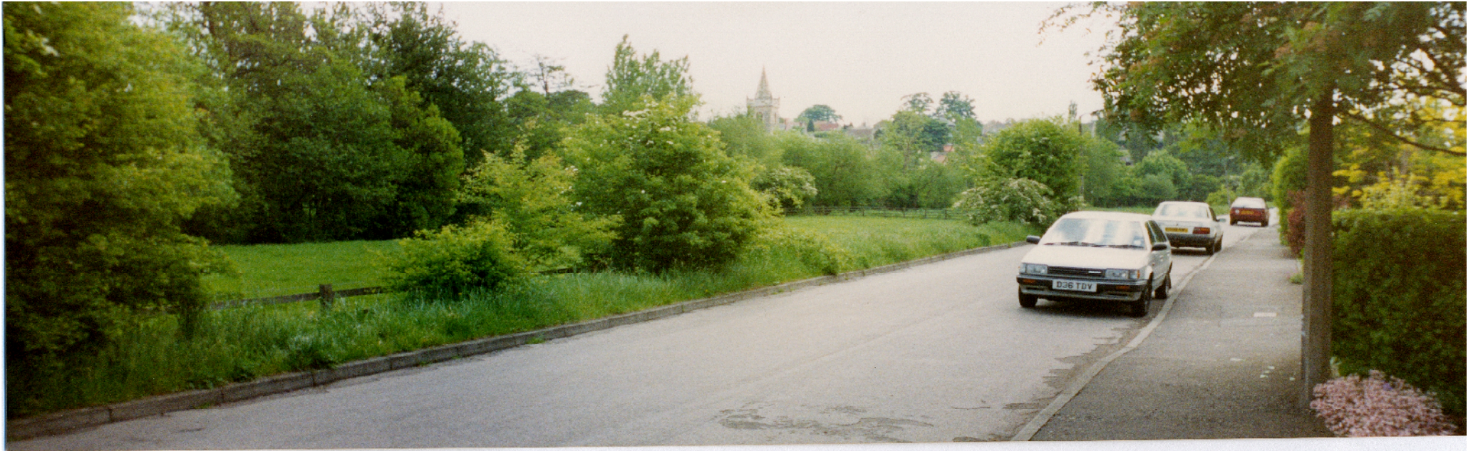
Firbeck: the original field, and the first phase housing of c. 1970.